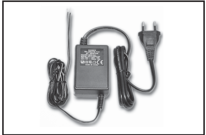
Figure 2: PT3E Power Supply